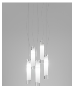
LIO SP 5