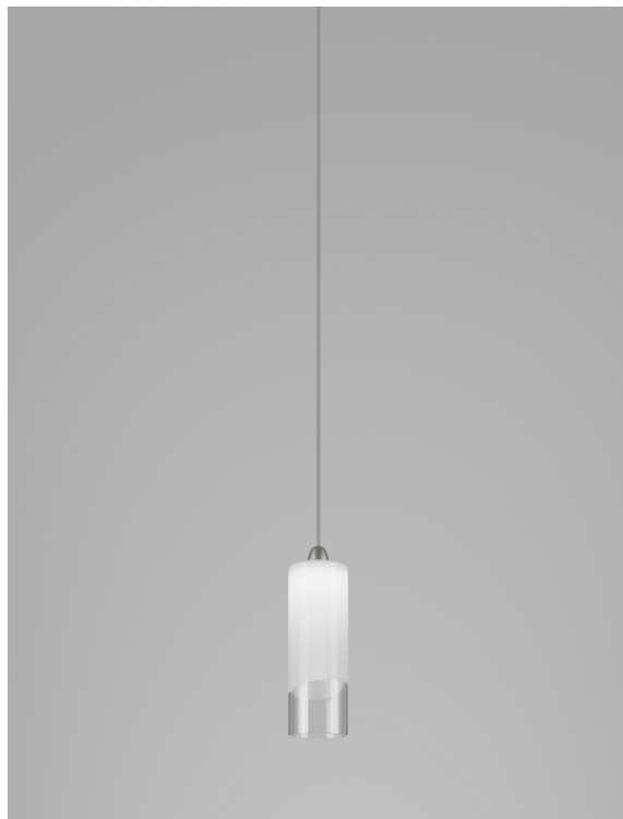
LIO SP 1 P CRBC NI G9 CE